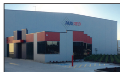
Pakenham 61 Peet Street, Pakenham, VIC 3810 P 03 5940 6100 F 03 5940 6155