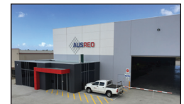
Geelong 32 Leather Street, Breakwater VIC 3219 P 03 5272 7100 F 03 5272 7111