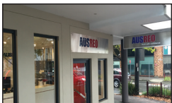
Crows Nest 3/29 Holtermann Street, Crows Nest NSW 2065 P 02 9462 8800 F 02 9462 8810