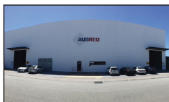
Moorabbin 33 Nelson Street, Moorabbin, VIC 3189 P 03 8552 8000 F 03 8552 8011